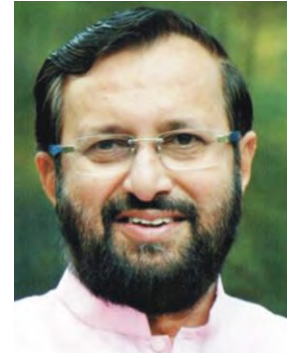
Sh. Prakash Javadekar Hon'ble Minister HRD Govt. of India