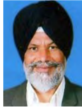
S. Surjit Singh Rakhra Hon'ble Higher Education Minister Govt. of Punjab