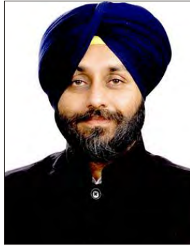
S. Sukhbir Singh Badal Hon'ble Deputy Chief Minister Punjab