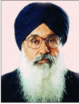
S. Parkash Singh Badal Hon'ble Chief Minister Punjab