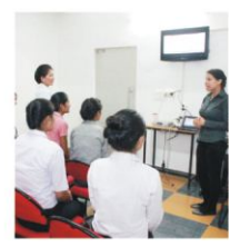
VIRTUAL ART OF COMMUNICATION