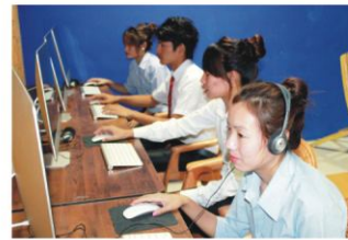
BASIC COMPUTER SKILLS