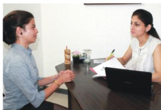
MOCK INTERVIEW SKILLS