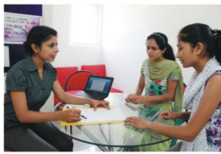
APTITUDE & PSYCHOMETRIC TEST