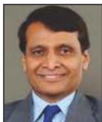
Sh. Suresh Prabhu Hon'ble Minister for Commerce & Industry, Govt. of India