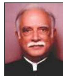
Sh. Ashok Gajapathi Raju Pusapati Hon'ble Minister for Civil Aviation Govt. of India