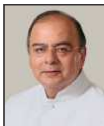
Sh. Arun Jaitley Hon'ble Finance Minister Govt. of India