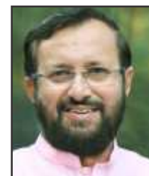
Sh. Prakash Javadekar Hon'ble Minister HRD Govt. of India