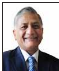
Gen. (Dr) V.K. Singh (Retd) Hon'ble Minister of State for External Affairs Govt. of India