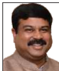
Sh. Dharmendra Pradhan Hon'ble Minister Skill Development & Entrepreneurship Govt. of India