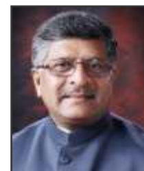
Sh. Ravi Shankar Prasad Hon'ble Minister Electronics & IT Govt. of India