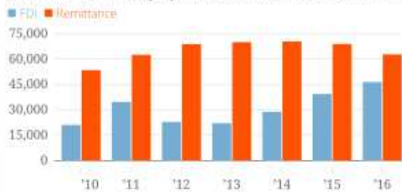
Remittances and FDI equity inflows to India, 2010-16 (US$, million)

http://www.nriol.com/indiandiaspora/statistics-indians-abroad.asp