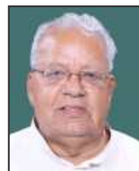
Sh. Kalraj Mishra Hon'ble Union Minister MSME, Govt. of India