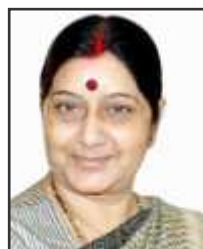
Smt. Sushma Swaraj Hon'ble External Affairs Minister Govt. of India