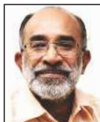
Sh. K.J. Alphons Hon'ble Minister of State (Independent Charge) for Tourism Govt. of India